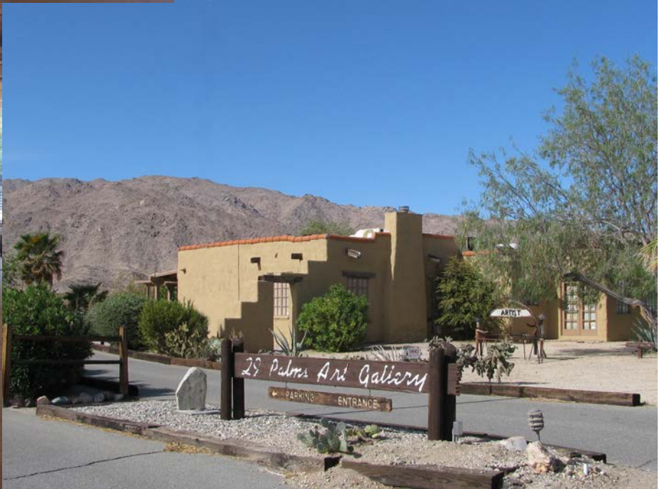
13th annual JTNP Art Expo juried exhibition opening day, Nov. 1, 2025