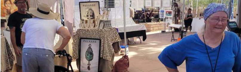
Some of the artist booths at Art Expo opening weekend featured local artists plus several juried artists from out of town. Booth sales were more than $9,000!